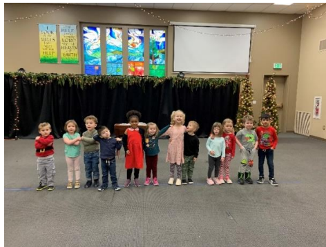
Tues/Thurs 3 year olds

It involves about an hour of your time, about 6 times in the year during the lawn mowing months and we can be flexible in the schedule.