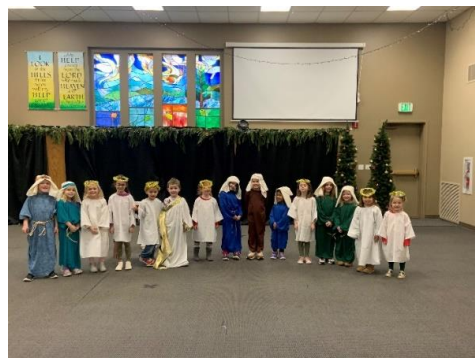
M/W/F 4 & 5 year olds

Just in case you missed seeing our sanctuary all decorated for Advent, here is a picture that captures the excitement and celebration of our coming Lord and Savior.